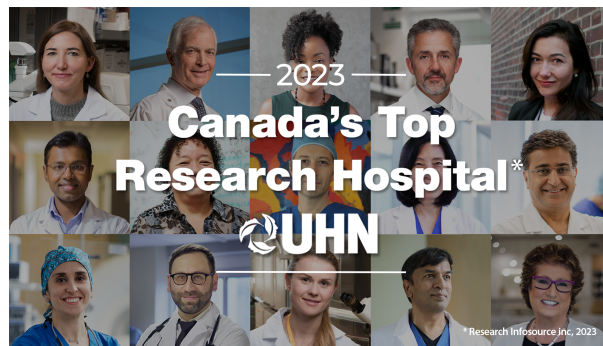
Canada's Top Research Hospital /read more