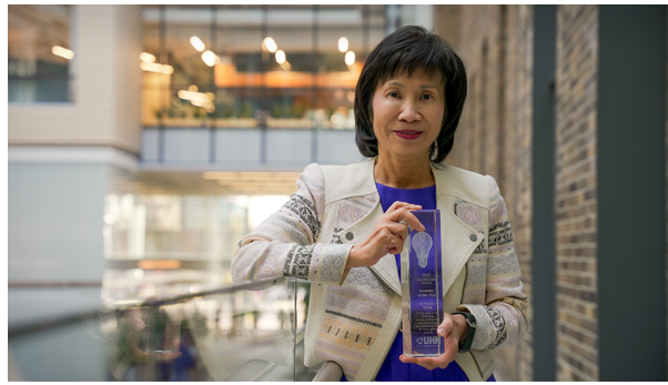
UHN Inventor of the Year 2023 /read more