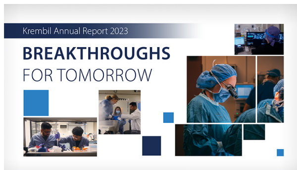
Breakthroughs for Tomorrow /read more